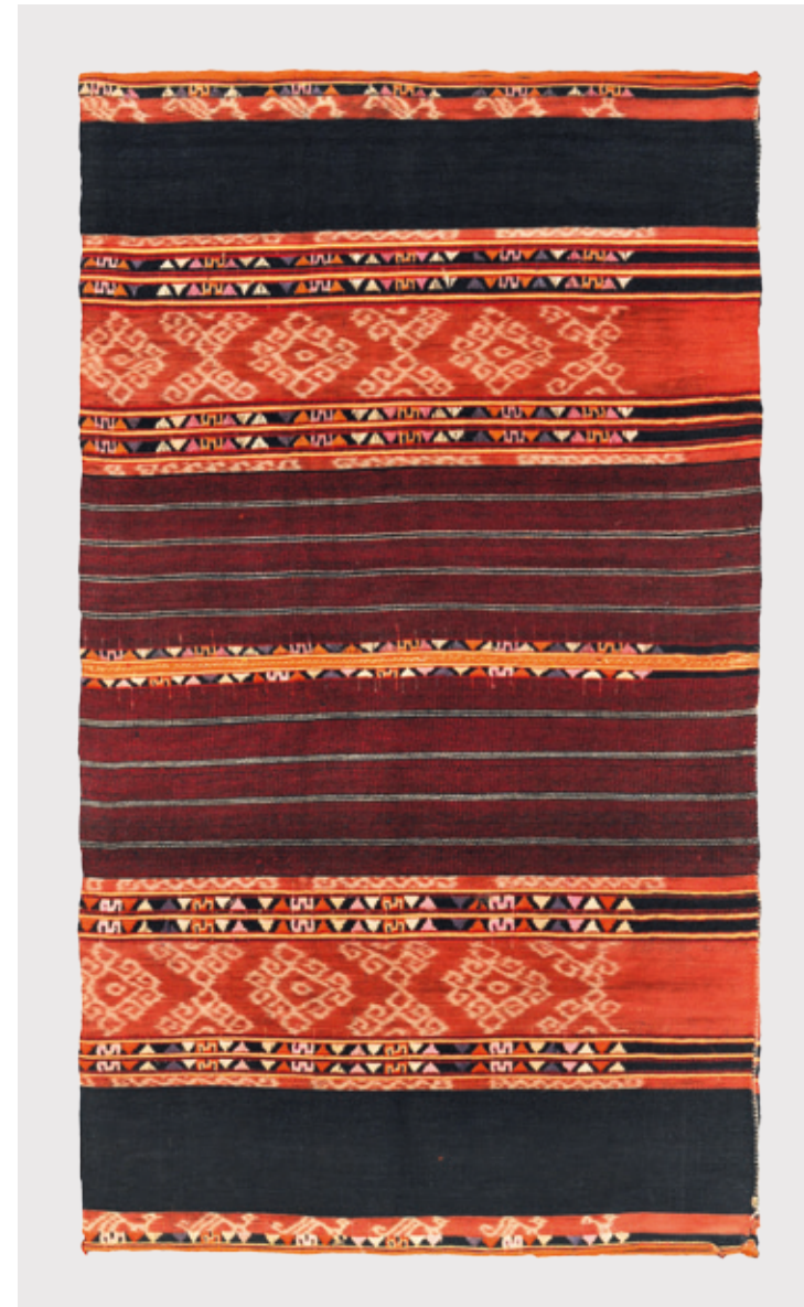
4 Sarong, Kewatek, Adonara Solor & Alor Archipelago, 19th century. Warp ikat in medium hand-spun cotton, pinstripes in silk, 0.71 x 1.33 m (2' 3" x 4' 4"), 2 panels